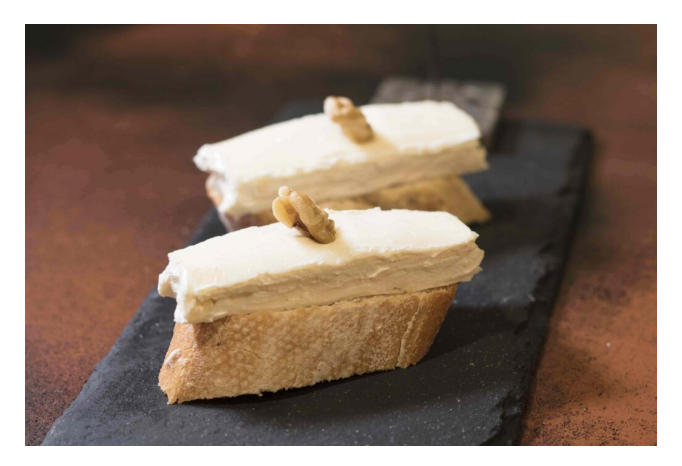
Milhojas de Idiazabal