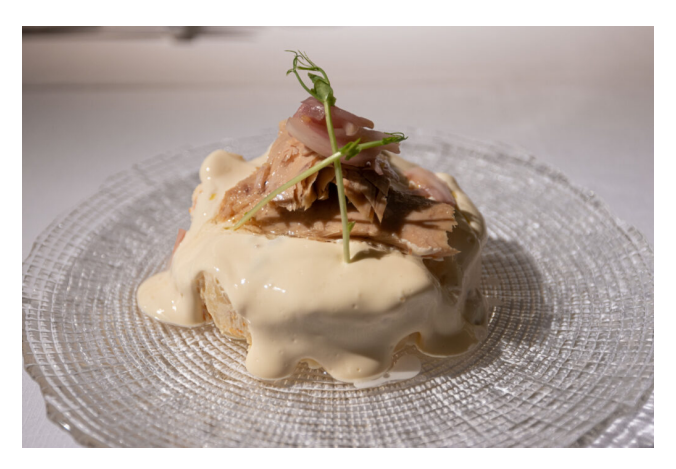
Ensaladilla de La Viña de Henao

A tapa that is always sure to please is Russian salad (also known in English as Olivier salad). But if it just happens to be the best you can find anywhere in Spain, then just imagine what it must taste like! It's a veritable festival of flavours and there's no way we could leave it off this list. The salad they serve at La Villa de Henao has just won first prize in the 6th Spanish "Ensaladilla" Championship, organised by Gastronomika last autumn. As you would expect, the basic ingredients are potatoes, carrots and eggs, cut into large chunks, along with tuna from Bermeo, chopped peppers, olives, pickled onions and pea sprouts. They use Hellman's mayonnaise mixed with milk and EVOO until they get the desired flavour and texture. LA VIÑA DE HENAO. Calle Henao, 27. Bilbao Centro