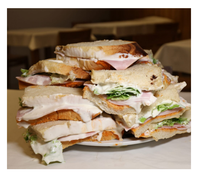
Sandwich de El Eme