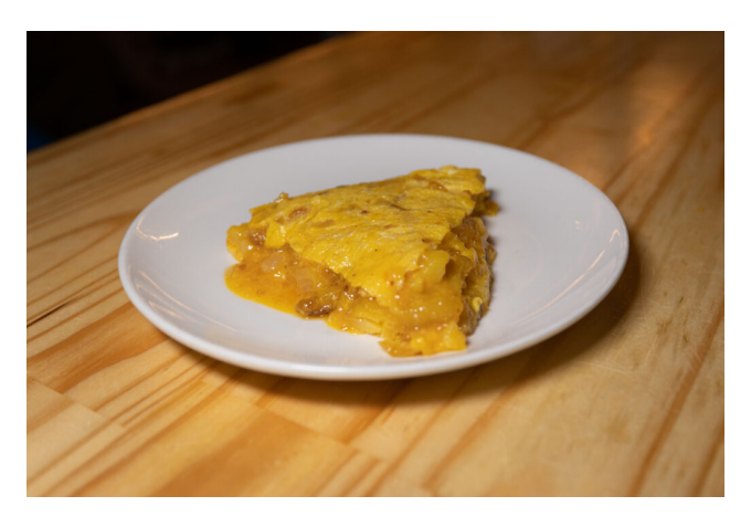
Tortilla de La cocina de Aitxu

caramelised onions, with truffled potatoes, with chilli peppers (they use the 'Alegría Riojana' variety)... and of course, they are all made with free-range eggs and locally sourced potatoes. LA COCINA DE AITXU. Calle Heros, 21. Bilbao Centro