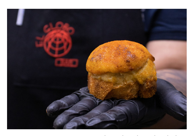
Txangurro gratinado de El Globo

One of the most acclaimed and exquisite pintxos on offer in Bilbao's pintxo bars is crab au gratin, but of all the establishments where you can try it, one that stands out: the El Globo Bar, which has just won the 2023 award for the