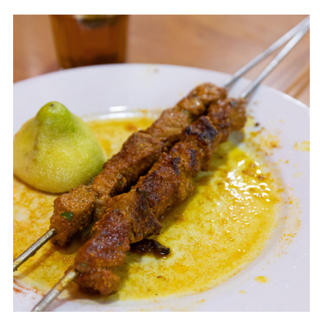
Pintxo moruno del Berebar

These marinated pork kebabs are another temptation that is hard to resist: their tantalising aroma is always enticing. Without a doubt, the most famous pork kebabs you'll find anywhere in the Botxo (that's the local name for Bilbao) are the ones they serve at Café Iruña, Bilbao's legendary Mudejarstyle café. The Belkhir family has been making these slightly spicy lamb kebabs for decades. CAFÉ IRUÑA. Calle Colón Larreategi, 13. Bilbao Centro