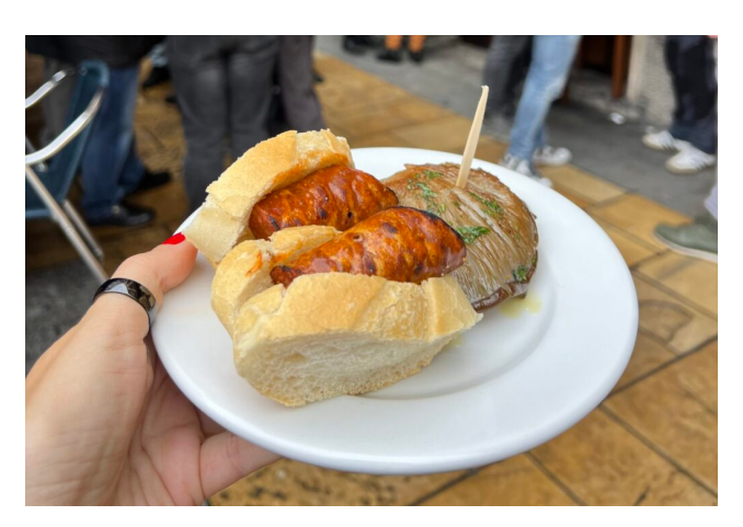
Txori al infierno del Bar Bacaicoa

la gloria', cooked to order with a unique home-made garlic sauce. If you want to try the original, then the Bacaicoa Bar is the place to go. And to accompany it, nothing better than the house wine, harvested and produced in their own vineyards in La Rioja. BAR BACAICOA. Plaza Miguel Unamuno, 2. Casco Viejo