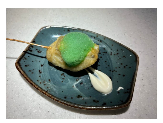
Pintxo de bacalao del Bar Egurre

If there is one food that Bilbao is famous for, it just has to be <u>cod</u>. It's prepared in several different ways: "a la vizcaína" (Biscay-style) "al pilpil" (with pil pil sauce)... But nowadays, cod is also prepared as a pintxo - so much so that they run a Cod Pintxo Competition in the Casco Viejo. The recent winner of the 7th annual competition, the Egurre Bar, offers a pintxo of cod in tempura, with citrus foam and smoked mayonnaise that can be eaten in one or two bites. BAR EGURRE. Calle María Muñoz 6